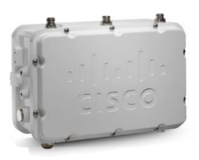
Figure 1. Cisco Aironet 1522

The Cisco Aironet 1522 supports dual-band radios compliant with IEEE 802.11a and 802.11b/g standards. Various uplink connectivity options are supported such as Gigabit Ethernet (1000BaseT), and small form-factor pluggable (SFP) for fiber (100BaseBX) or cable modem interface. Power options supported includes 480VAC, 12VDC, cable power, Power over Ethernet (POE), and internal battery backup. It also employs <a href="Cisco's Adaptive Wireless Path Protocol">Cisco's Adaptive Wireless Path Protocol</a> (AWPP) to form a dynamic wireless mesh network between remote access points, while delivering secure, high-capacity wireless access to any Wi-Fi-compliant client device (Figure 2).