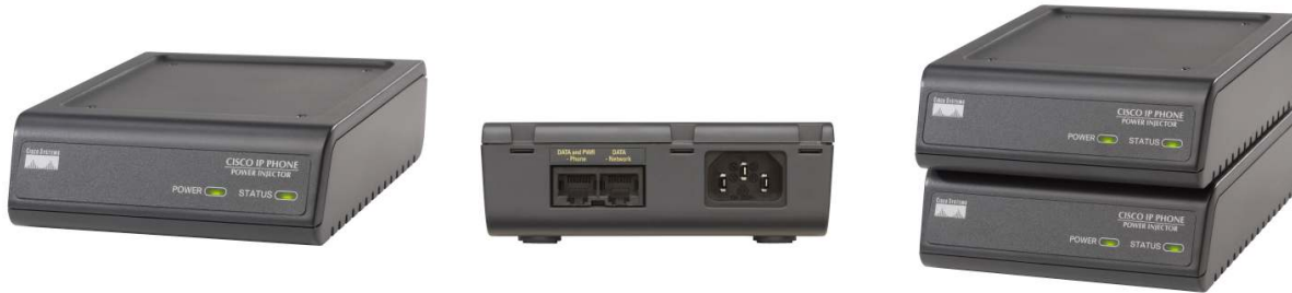
Figure 1. Cisco Unified IP Phone Power Injector (Front, Back, and Stacked Views)

The Cisco Unified IP Phone Power Injector is a midspan power injector designed and tested for use with Cisco Unified IP phones. The Cisco Unified IP Phone Power Injector sits between a switch port and the Cisco Unified IP phone, providing inline power capability to an unpowered switch port. It supports Cisco midspan power, IEEE 802.3af modes for supplying power to the attached phone, and 10/100/1000BASE-T Ethernet connections. Figure 2 shows the maximum distance of the Cisco Unified IP Phone Power Injector between a Cisco Unified IP phone and an Ethernet switch.