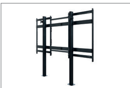
Low space requirement thanks to floor-wall mounting