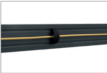
Cable routing with clips

In addition to the pre-configured systems, HAGOR offers customised special solutions in the LED sector, which can be individualised with accessories such as loudspeakers, controls and so on to meet all requirements.